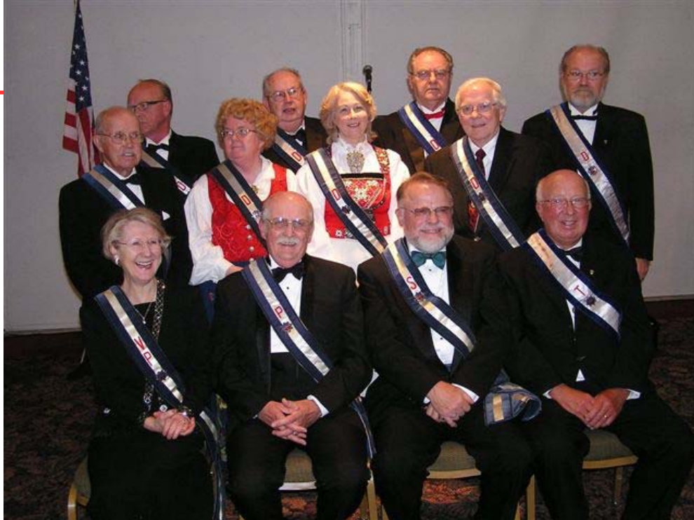
New 2008 International Board